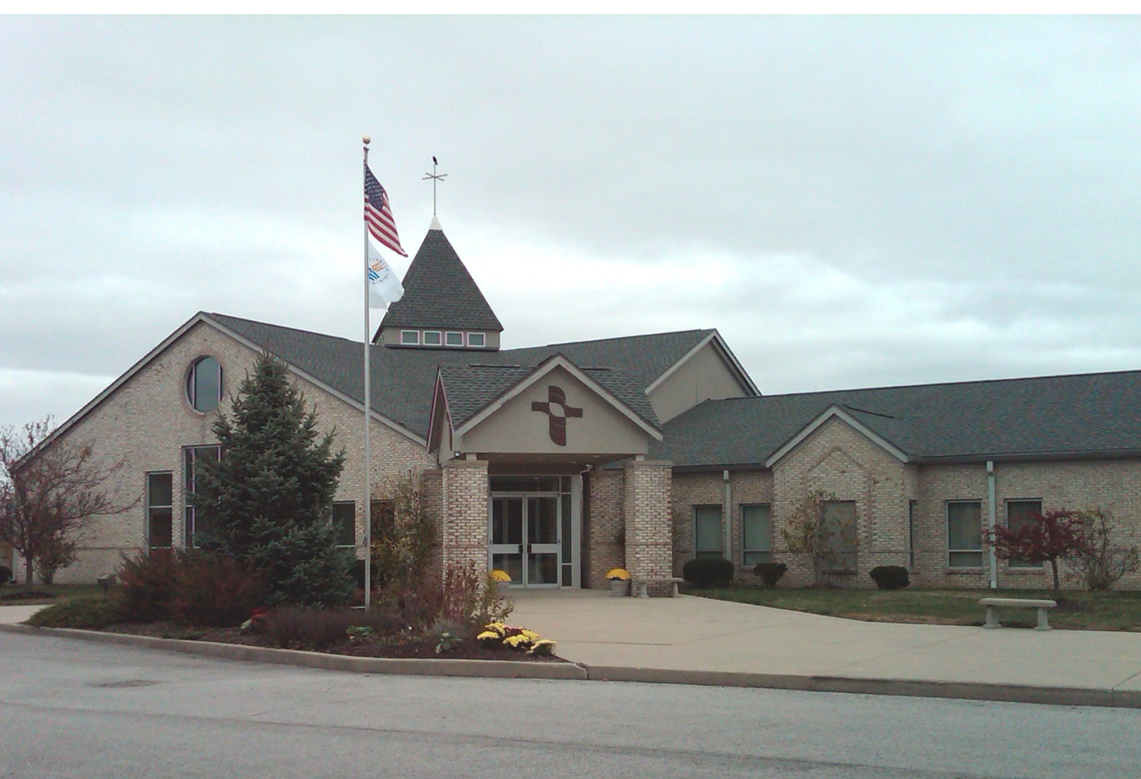
May 28, 2023