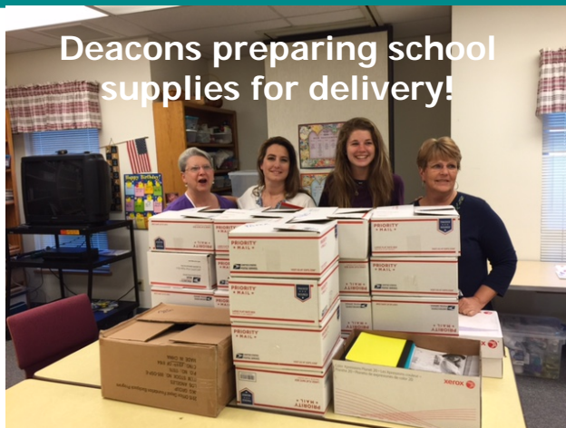
Deacons preparing school supplies for delivery!

Westminster's new Family and Adult Services Center is now home to High School Equivalency (HSE) classes and English as a Second Language (ESL) classes. In spring of 2015, WNS began a partnership with MSD Warren Township Schools to provide HSE and ESL classes for adults in our community. A total of 76 students have participated in classes since orientation was held in May. Currently, WNS offers 3 morning sessions (2 ESL and 1 HSE) and 2 afternoon sessions (1 ESL and 1 HSE).